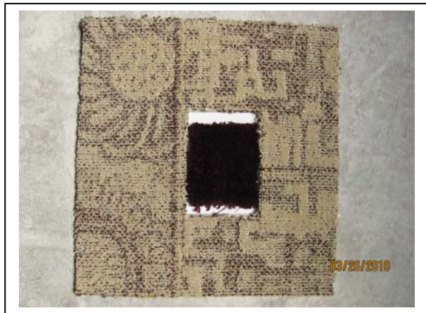
Mahamandap Carpet & Border selected