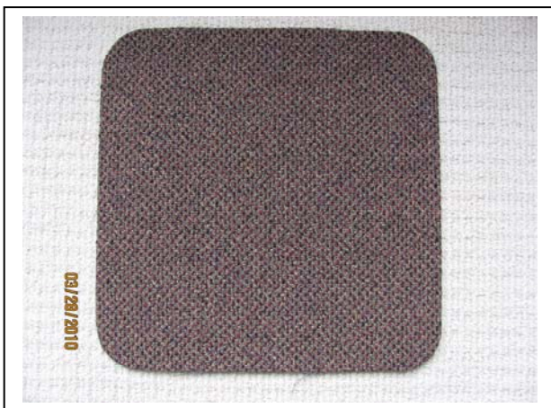
Other area carpet selected