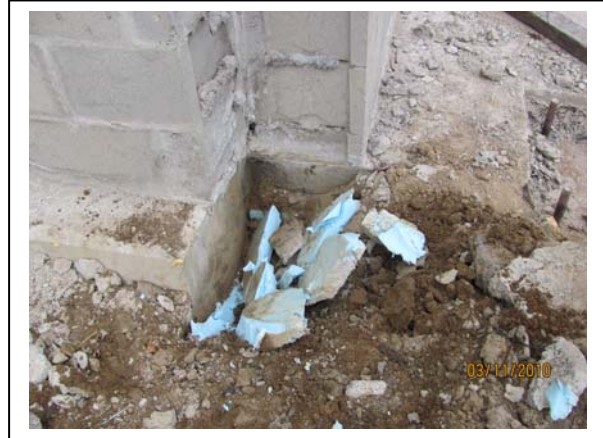
Footing issue uncovered