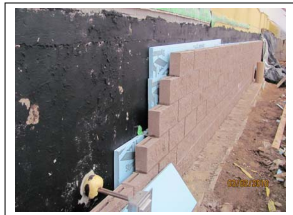
East Connector Area Masonry veneer progressing