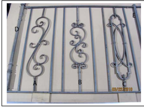
Visit to hand railing fabricator's shop