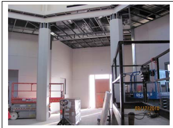
Drywall work progressing