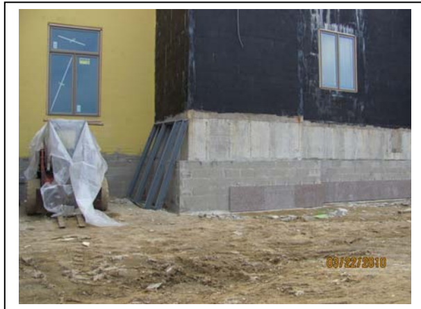
Granite panels progressing