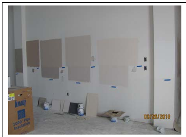
Paint colors selected