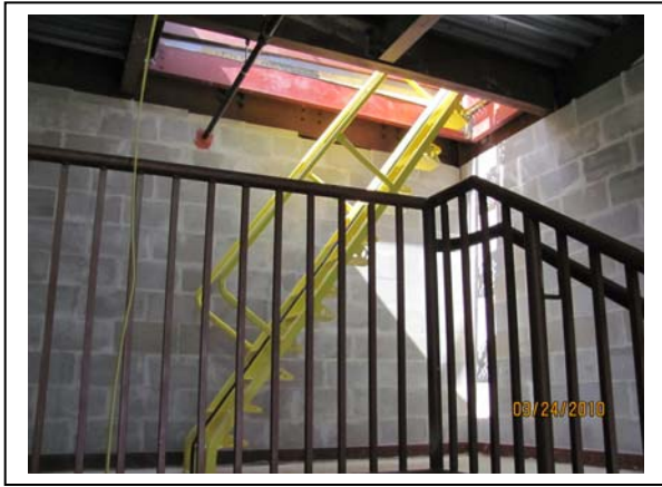
Roof access ladder installed