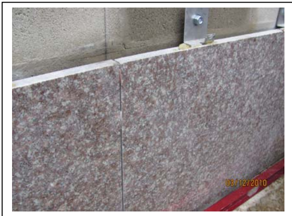
Granite sealant color selected