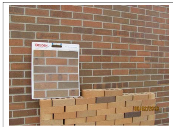
3/2/09 Brick Selected