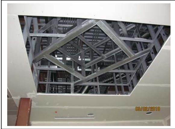
Deity Ceiling Area in progress