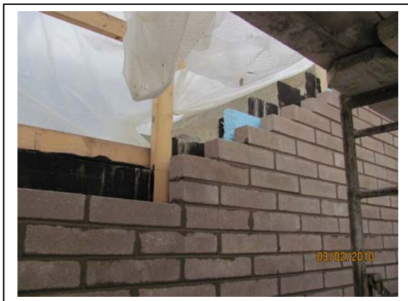
Toran Stair area in progress, method to seal at C.T. tread discussed.