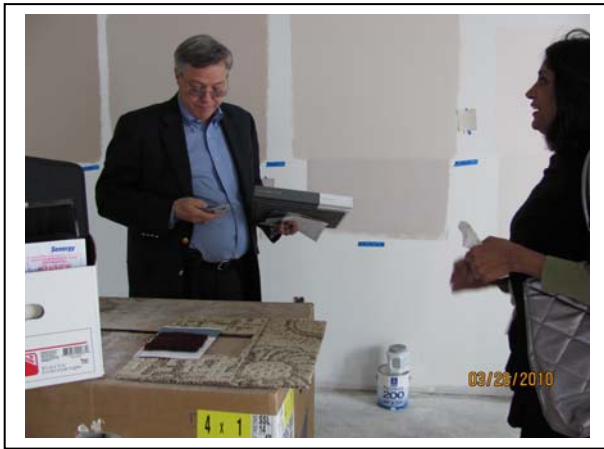
Color selections in progress