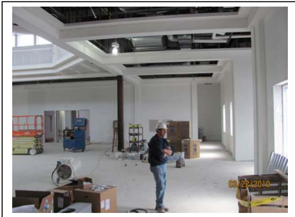
Drywall work progressing